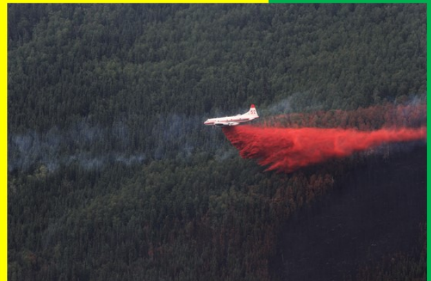
Tanker 52 makes a retardant drop on the Munson Creek Fire east of Fairbanks on Sunday, July 11.