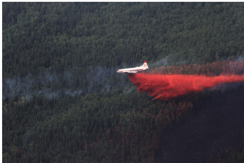
Air tanker 52 drops a load of fire retardant to slow the progress of the Munson Creek Fire on Sunday, July 11, 2021.

where fire managers hope it remains. The tanker then dropped a 2,000-gallon load of water on an active portion of the fire just south of Bearpaw Butte to flush out the old retardant.